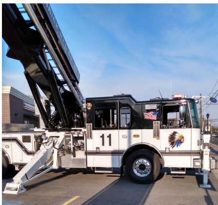
Merrick Hook and Ladder Fire Department Truck #11

On Thursday, March 11, 2021, members of the Merrick Hook & Ladder Fire Department restrung the flag pole at our Post, in order to fly the American Flag and POW MIA Flag once again from our flag pole. Thank you to the members of the Merrick Hook and Ladder Fire Department from the Members of Merrick Post No. 1282, American Legion. Here are few pics.