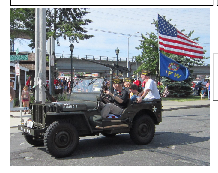
Post members at the staging area of the Merrick's Memorial Day Parade.

The Merrick / Freeport VFW #1310 jeep at the Merrick's Memorial Day Parade