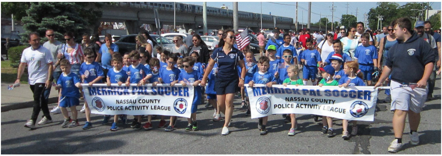
Merrick PAL Soccer at the Merrick's Memorial Day Parade on May 29, 2023