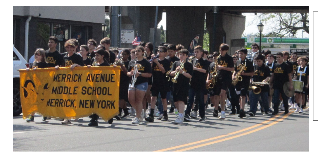
Members of the Merrick Avenue Middle School band heading up (in front of the Merrick Fire Department) at the Merrick's Memorial Day Parade

On 5/28/2023, Boy Scout Troop #351 members and their parents helped set up barricades at the beginning of the Memorial Day Parade route which was by Merrick Avenue and Broadcast Plaza and by the end of the parade, which was the Merrick's Veteran Memorial Park. Thank you all your hard work setting up and breaking down the barricades for this event. In this picture are members of Boy Scout Troop #351 and their parents getting goofy for a picture at the Merrick's Veteran Memorial Park.